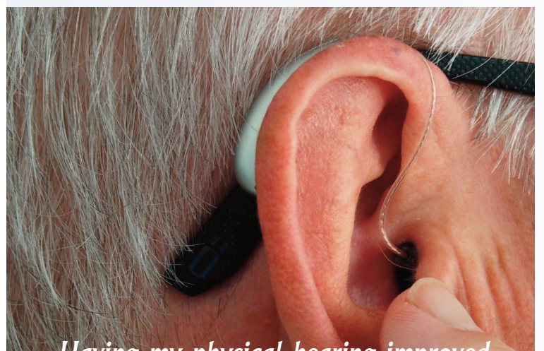
Having my physical hearing improved has helped me become more aware of my need to listen more carefully to God.

The truth is, when you examine the biblical revelation of God, in the person of Jesus, God is seldom